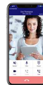
ST500 Mobile Client

*Handsets may have regional availability - check with your NEC reseller for further details