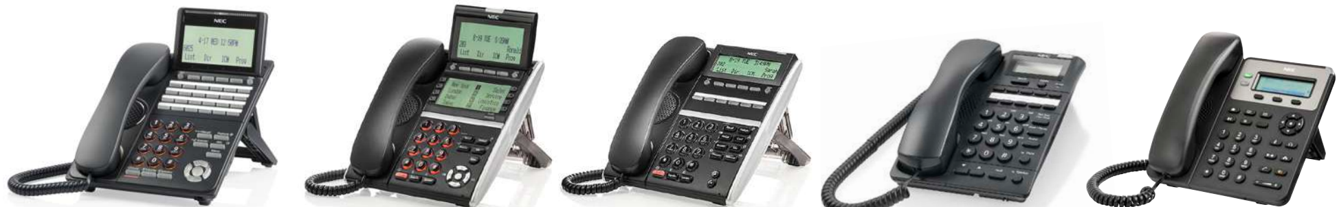
DT530 24 button