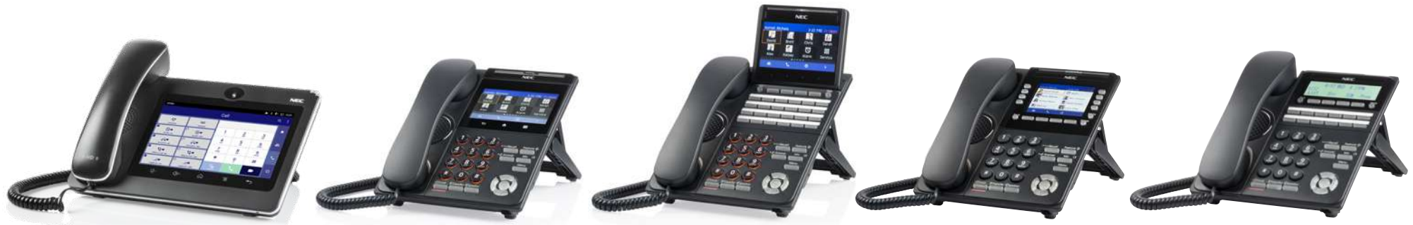
GT890 Video Phone