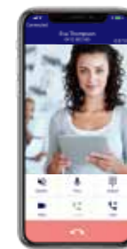
ST500 Mobile Client

*Handsets may have regional availability - check with your NEC reseller for further details