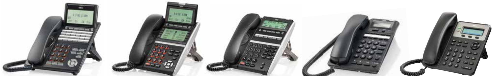
DT530 24 button