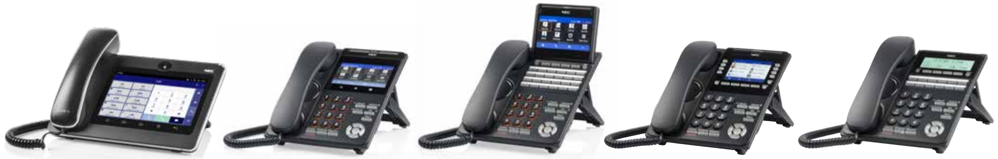
GT890 Video Phone